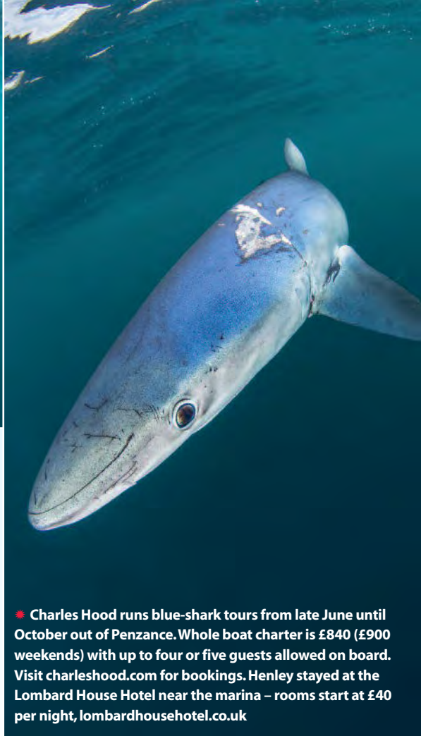
* Charles Hood runs blue-shark tours from late June until October out of Penzance. Whole boat charter is £840 (£900 weekends) with up to four or five guests allowed on board. Visit charleshood.com for bookings. Henley stayed at the Lombard House Hotel near the marina – rooms start at £40 per night, lombardhousehotel.co.uk